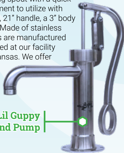
Lil Guppy Playground Pump

Our Lil Guppy Playground Pump comes with a standard 12" long spout with a quick connect attachment to utilize with our accessories, 21" handle, a 3" body and a 7" flange. Made of stainless steel, the pumps are manufactured and hand polished at our facility in Conway, Arkansas. We offer a 3-year warranty on all manufactured parts!