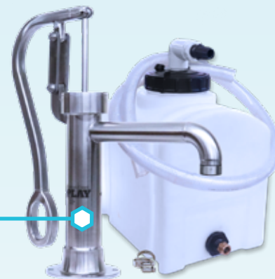
Lil Guppy Playground Pump System

Some landscapes call for separating the Cadron Creek Play pump from the tank. In these cases, we offer the Lil Guppy Playground Pump System , which includes an 8-gallon plastic tank plus reinforced hose to connect the two. With this setup, the pump can be mounted on a log, rock or other structure and the tank placed in a safe location away from the play area and out of the sun.