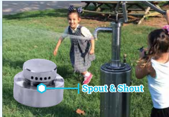
Spout & Shout

Add more fun to the Cadron Creek Playground pumps with our stainless steel Spout & Shout quick connect attachment. This device sprays water from the spout as the children pump!